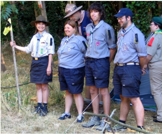
Taking inspection seriously!