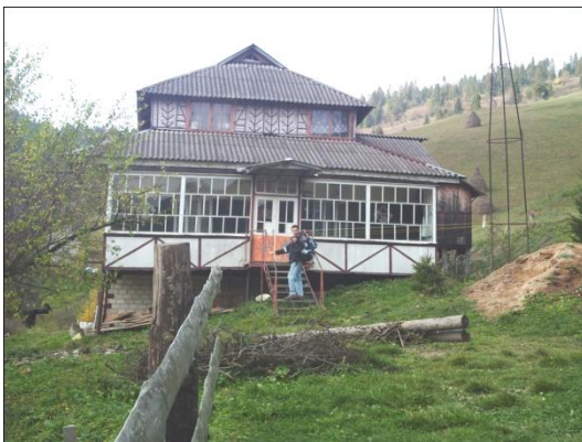
The Scout house