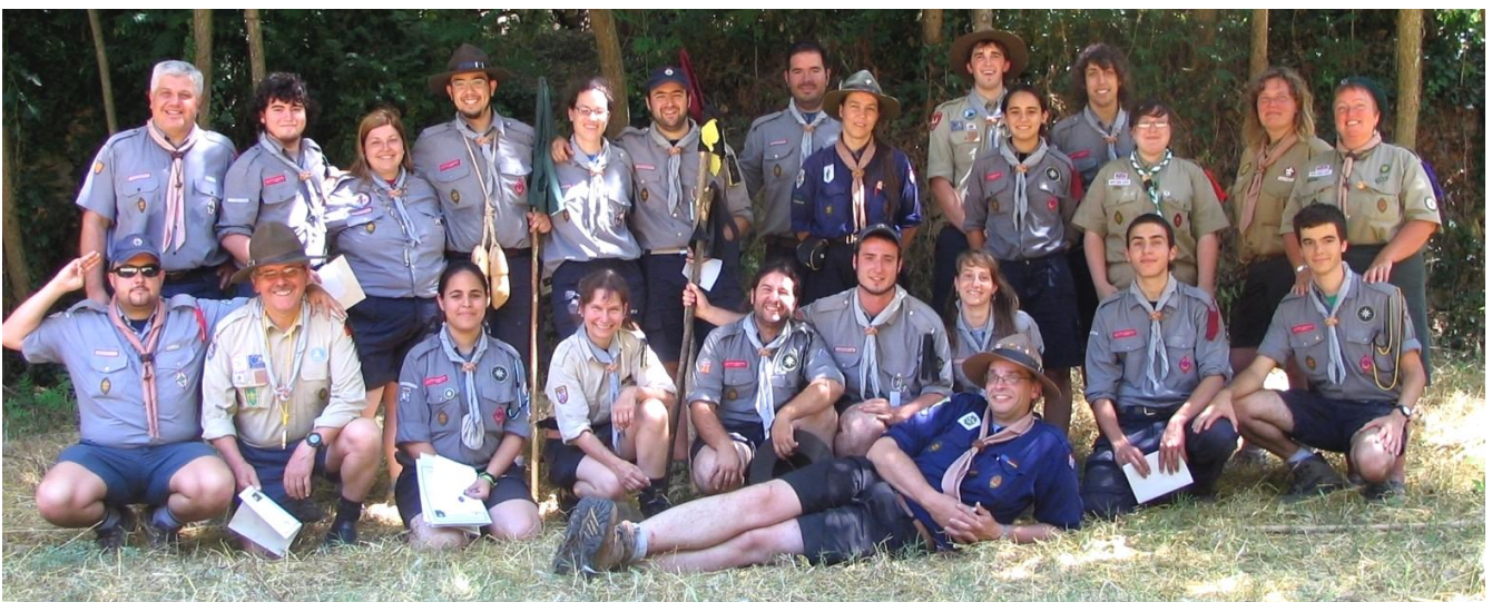
The Woodbeads Course 2009