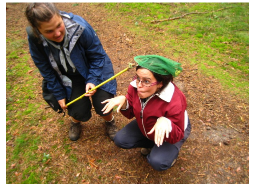
(Beavers alive in training)