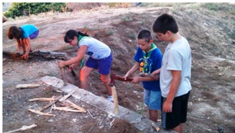
Wood cutting using an axe

We tried to create a balance between having fun and taking the opportunity of the summer holidays to get more acquainted to the culture of our tiny island right in the middle of the Mediterranean Sea. Every Tuesday we held weekly meetings which were based on an hour of hands on scouting and another hour of physical exercise where together we learnt how to play baseball. During the cultural tours we went to visit places of general and historical importance in our history.