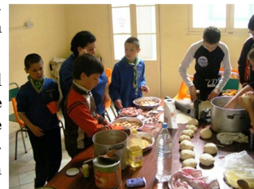
Making pastry for pizza

In March this year we went for a 4-day indoor camp with the theme "Building Bridges". Scouts participated in many different team building activities and they were responsible for most of the cooking during the camp. They worked very hard to obtain the cook badge.