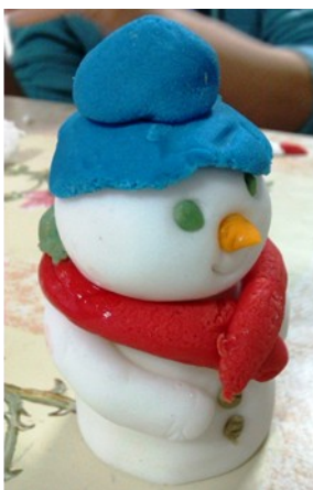
Snowman done using sugar pastry

In October the kids were back at school so we started our winter schedule with weekly meetings for all sections held on Fridays. November saw us visiting a re-enactment of the French reign in Malta and also a visit to the Annual Malta Air Show. We also spent a weekend together and participated in the Joti-Jota activities held worldwide.