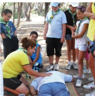
First aid at Camp

In August we held our first summer camp in our sister island Gozo where our cubs and scouts learnt the skills of fishing and obviously swimming.