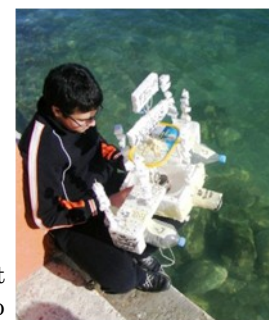
A floating model—recycling

We are doing our utmost to live the Scout promise to the full. If everybody was to follow this promise, we are sure that the world would be such a better place.