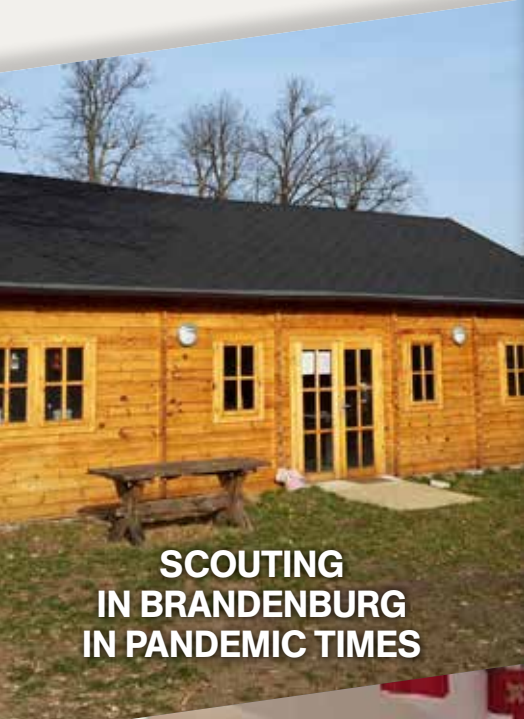
SCOUTING IN BRANDENBURG IN PANDEMIC TIMES