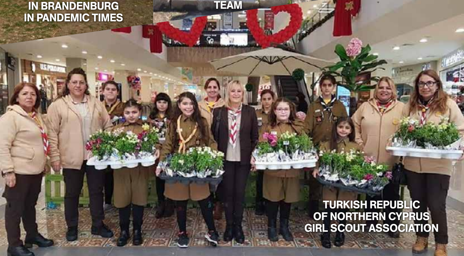
TURKISH REPUBLIC OF NORTHERN CYPRUS GIRL SCOUT ASSOCIATION