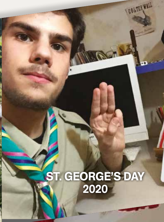
ST. GEORGE'S DAY 2020