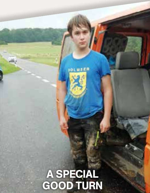
A SPECIAL GOOD TURN