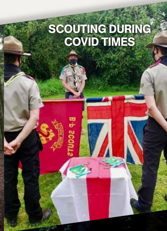
SCOUTING DURING COVID TIMES