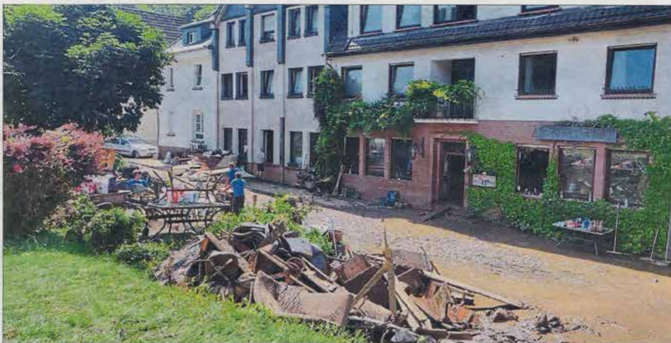
Groß ist die Zerstörung im Ahrtal und die Hilfe aus Laubach wird dringend benötigt.