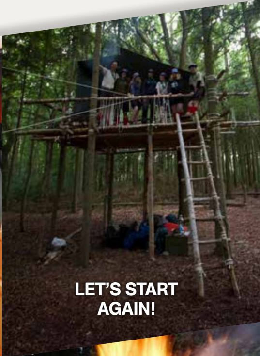
LET'S START AGAIN!