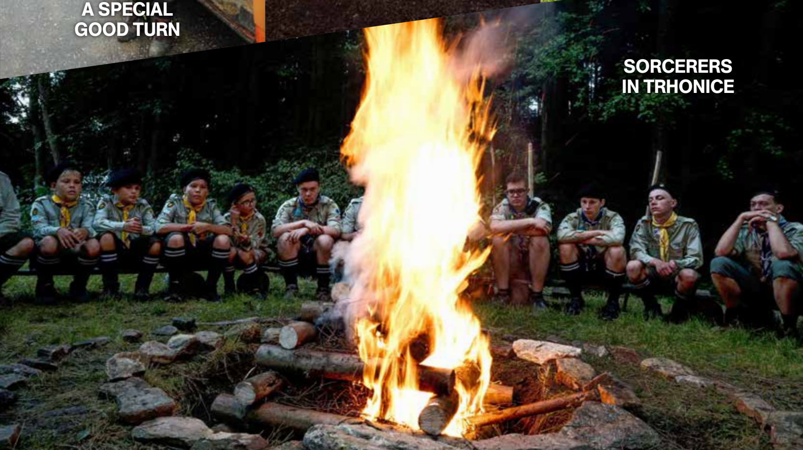
SORCERERS IN TRHONICE