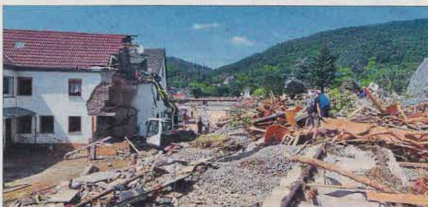
Die Solmser Pfadfinder unterstützen den Aufbau in den Flutgebieten.